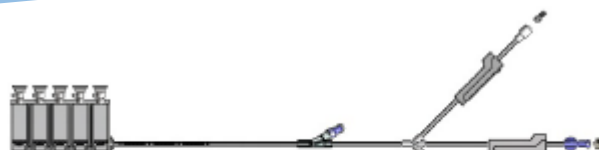
CS30M9 with empty syringe