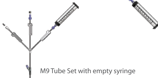
M9 Tube Set with empty syringe