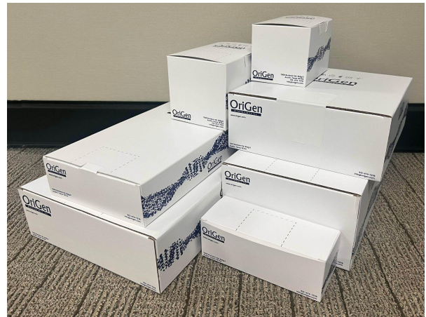
Mock up of new artwork and all 7 cartons with the new design